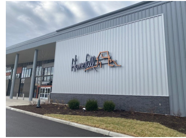
A New Home for Homefull