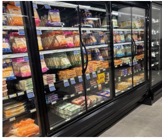
Great Food Selections

Later this year, Homefull plans to break ground on a new, childcare center just behind the first building. The center plans to serve nearly 100 children from infants to school-age. Stay tuned for more updates.